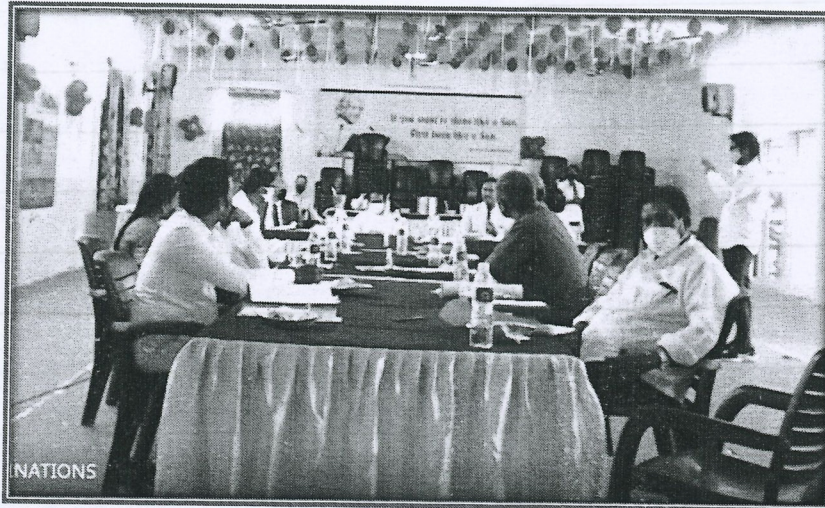
Members attended to XIV Governing Body Meeting held at KBN College Campus